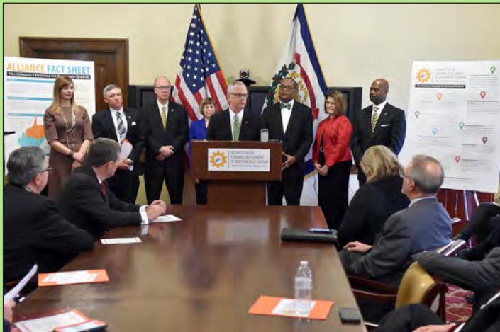
Presidents of the 10 public higher education institutions, statewide leaders and legislative members come together for an Alliance press conference at the State Capitol.