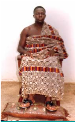
Asantehene Nana Osei Tutu II wearing adinkra cloth