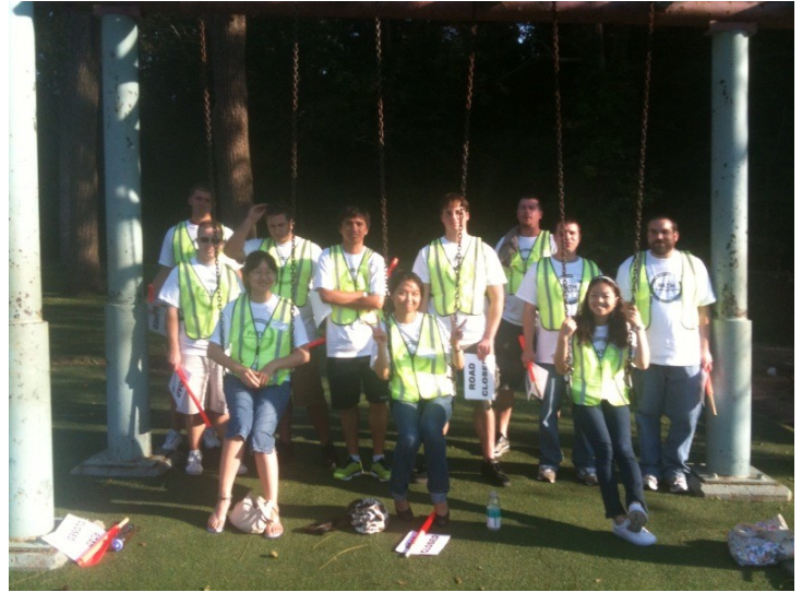
A group of members get ready to close streets off for the 5K