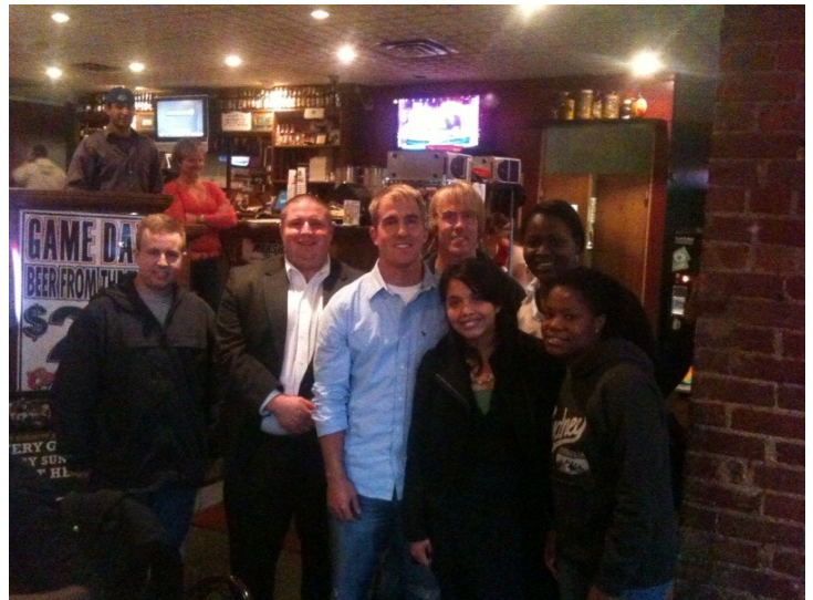
Beta Alpha Psi and International Students at their planning meeting at Giovanni's