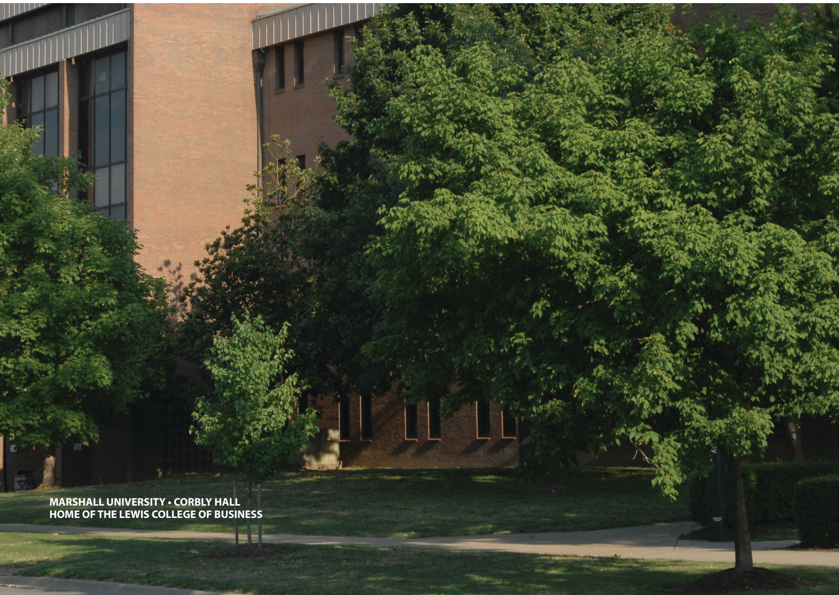
MARSHALL UNIVERSITY • CORBLY HALL HOME OF THE LEWIS COLLEGE OF BUSINESS