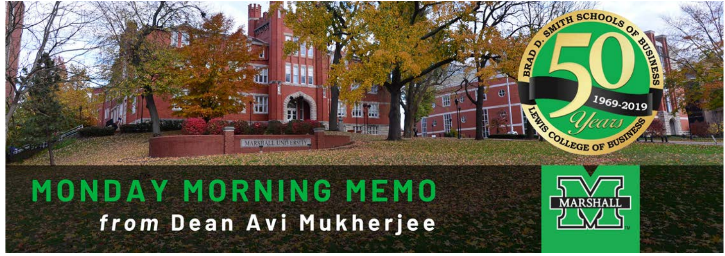
August 31, 2020 | Volume 4, Issue 2