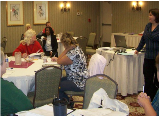
During the Year I ISS Follow Up Workshop #1 (October 23, 2009 in Charleston, WV), participants discuss the importance of including children in the planning and assessment processes.

Appalachian Council Head Start Child Development Academy @ MU Jackson County Schools Ritchie County Schools McDowell County Schools North Central WV Head Start Putnam County Schools Stepping Stones Academy Tri-County YMCA (Putnam Co.) Wirt County Schools