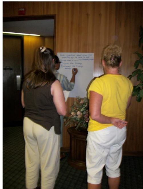
Resources as well were the subject of a brainstorming session.