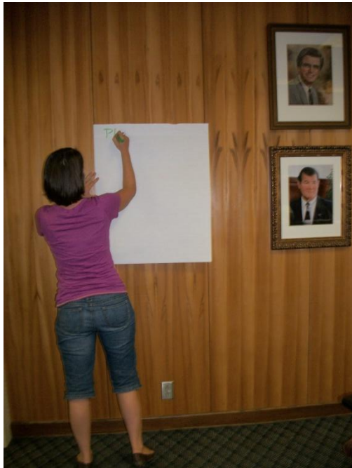
So many ideas were generated in the little conference room.