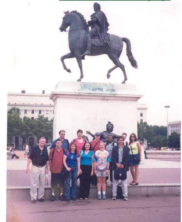
Students and Faculty at a Summer Language and Culture Program in Lyon, France.