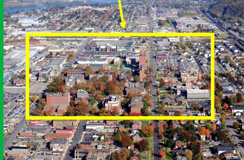
Marshall University Campus