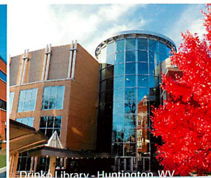
Drinko Library - Huntington, WV