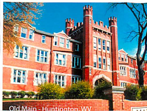
Old Main - Huntington, WV