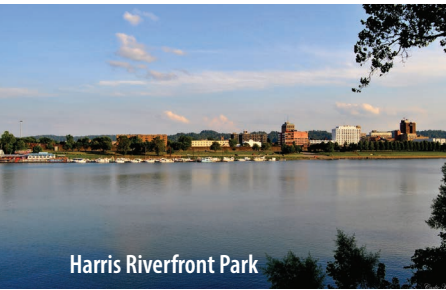
Harris Riverfront Park