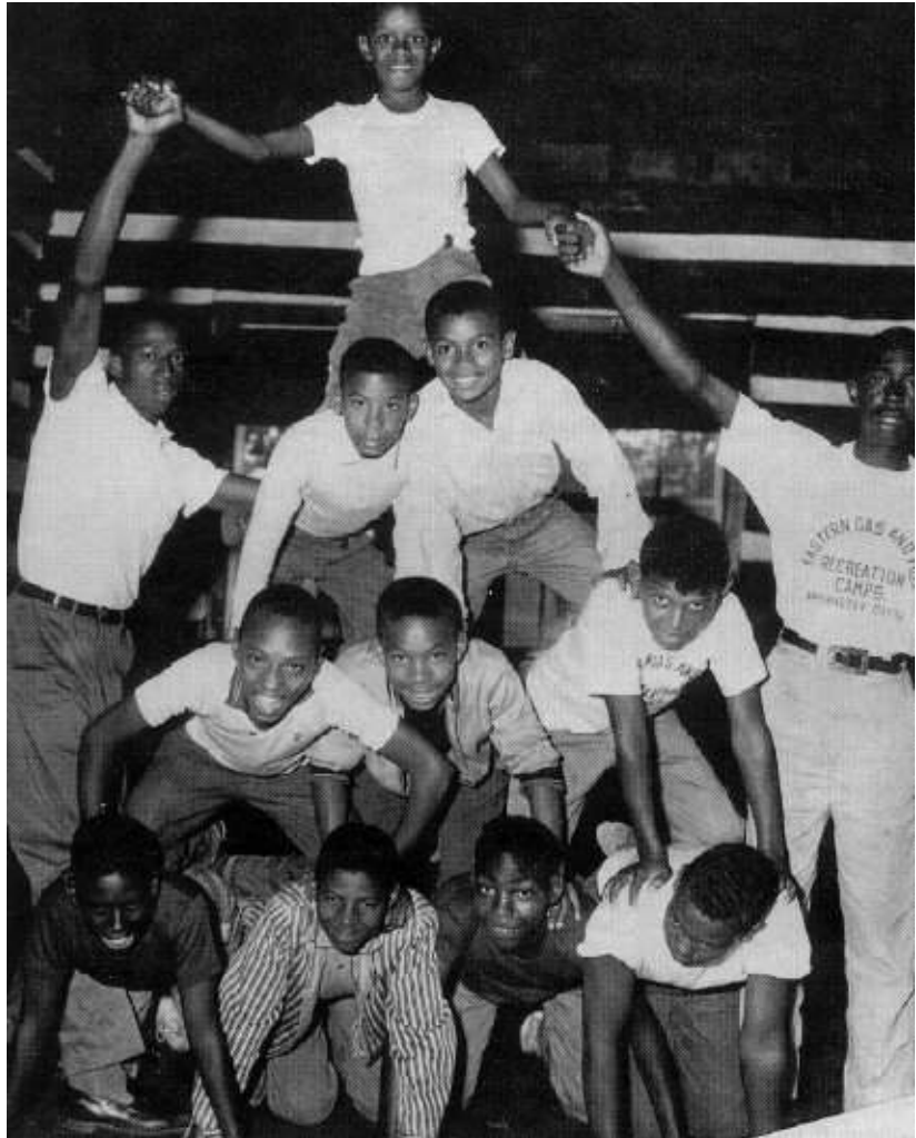
Camps sponsored by the fuel industry brought countless youngsters to Camp Washington-Carver

From 1942 to 1963, the Negro 4-H Camp was the primary non-school African American center for agriculture, mining, arts, and home economics education in our state. With the passing of the 1954 Brown vs. Board of Education Supreme