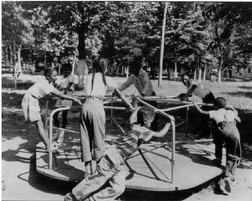
This merry-go-round was a popular attraction for kids at the camp, and a joyful memory of the author