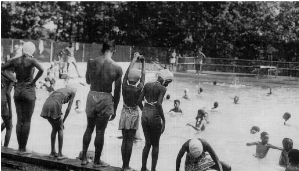
During the days of segregation, the need for a safe, clean and well-supervised swimming pool for West Virginia's African American citizens was a potent argument for building the camp. This pool at camp Washing-Carver got plenty of use. Photograph 1948.