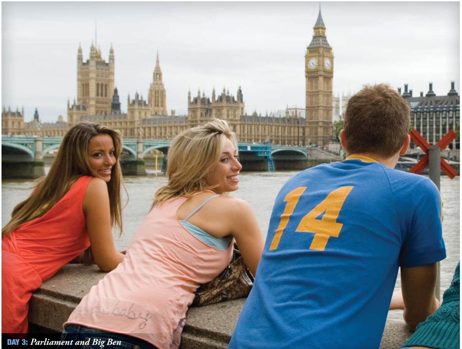
DAY 3: Parliament and Big Ben