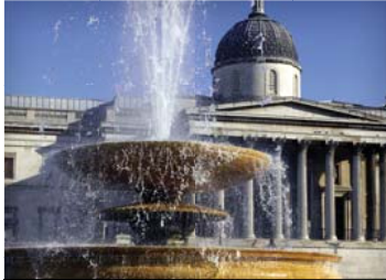
DAY 2: Trafalgar Square