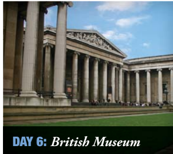
DAY 6: British Museum