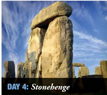
DAY 4: Stonehenge

Extend your tour and enjoy extra time exploring your destination or seeing a new place at a great value.