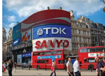
DAY 3: Piccadilly Circus