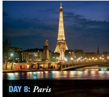
DAY 8: Paris