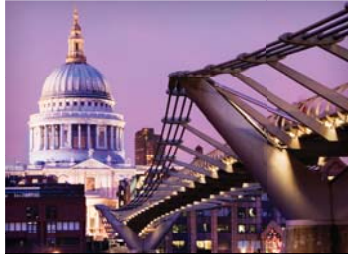
DAY 3: St. Paul's Cathedral