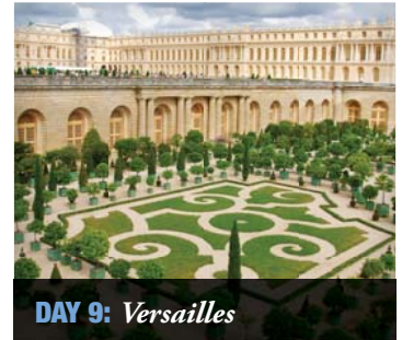
DAY 9: Versailles