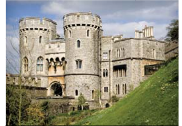
DAY 3: Windsor Castle