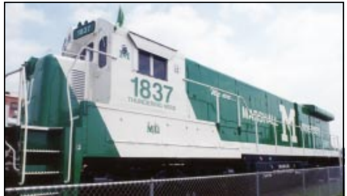
The engine, titled "385,000 Pounds of Rolling Thunder," was unveiled by CSX Corporation on June 1. It also has been renumbered to commemorate Marshall's founding date.