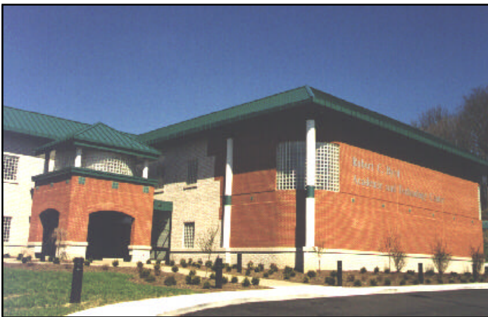
The Robert C. Byrd Academic and Technology Center in South Charleston has received a architectural award from the American School and University magazine.

The Byrd building was featured in a two-page color spread in November by the magazine in its Architectural Portfolio issue which showcased educational projects throughout the country. A panel of distinguished architects evaluated the entries looking for features that make an outstanding building. An important criterion for this year's entries was the integration of technology, for which the Robert C. Byrd Center received high marks.