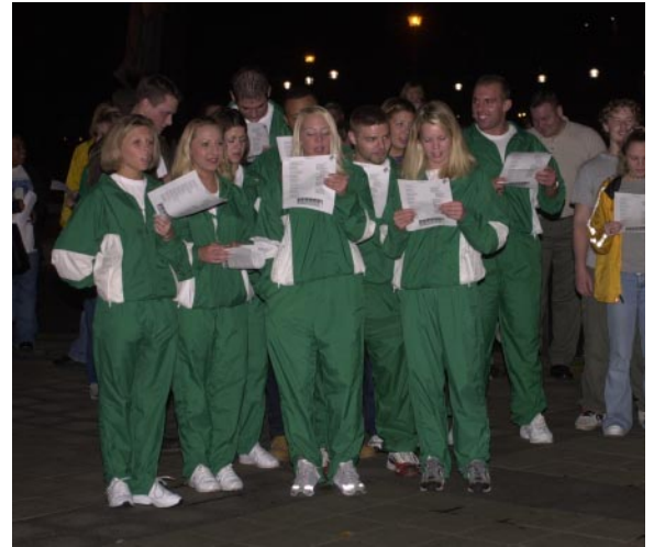
(Left) Marshall's Huntington campus turned into a virtual winter wonderland Nov. 27 as students and community members participated in a campus lighting event complete with a visit from Santa and Miss Claus. (Right) Marshall's cheerleading squad were among the holiday carolers. (More holiday events, page 3.)