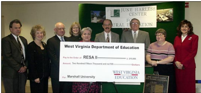
An oversize check representing the RESA II grant was presented on Nov. 14.

This project is being funded by the Regional Educational Service Agency II (RESA) through a $215,000 grant from the West Virginia Department of Education. The focus of the reading center is to maximize the reading potential of all West Virginia families through research, providing best practices for MU education majors and professional development for reading and language arts teachers in