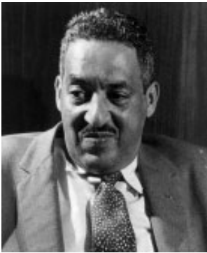
Thurgood Marshall, the first African American justice of the U.S. Supreme Court, is the subject of the latest in a Black Heritage series of U.S. postage stamps.

Members of the Marshall and Huntington communities as well as U.S. Postal Service representatives will conduct an unveiling ceremony of the 2003 Thurgood Marshall stamp at 6 p.m. Monday, Feb. 24.