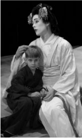
Cio-Cio San comforts her son, 'Trouble,' in the opera 'Madame Butterfly.'

An age-old tale of love and betrayal, joy and pain, set against a backdrop of rising and setting suns and fluttering cherry blossoms, told through lyrical music, comes to the Keith-Albee Theatre March 3 at 8 p.m., when the Marshall University Artists Series presents Puccini's masterpiece, "Madame Butterfly."