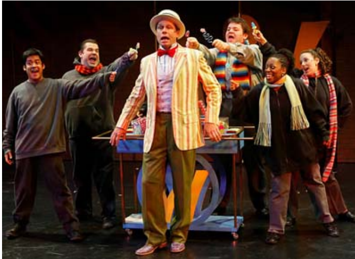
"Roald Dahl's Willy Wonka" is at the Keith-Albee Theatre April 13 as part of the Marshall Artists Series.

Adapted from Dahl's children's novel, "Charlie and the Chocolate Factory," the show invites audience members on an adventure of pure imagination where the rules are backward.