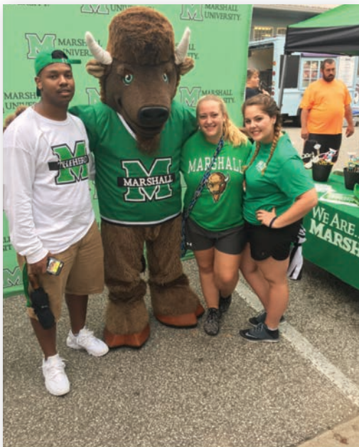
BROOKE @brookemarie03 Marshall rally 🍀 #marshall2020 #marshallwow 8:42 PM - 18 Aug 2016