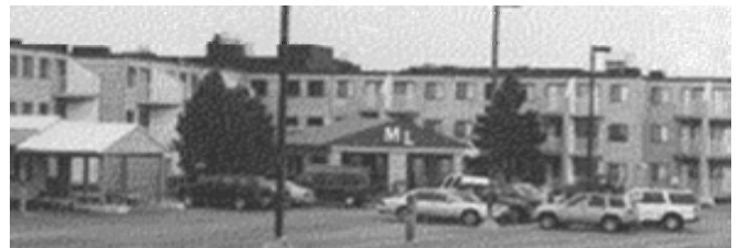
Mountain Lodge, Snowshoe Resort

Make sure to mention that you are part of the WVAMLE Conference. Conference rates are available through March 24, 2003.