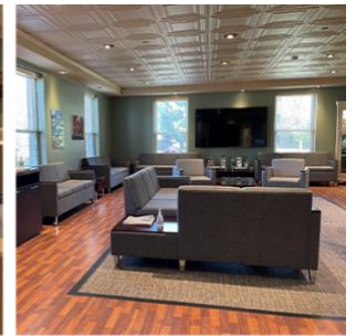
Welcome Center Lobby After