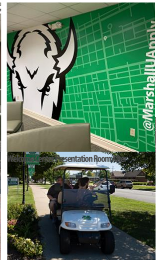
Golf Cart Tour