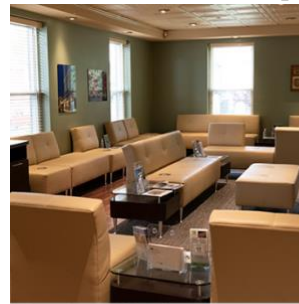
Welcome Center Lobby Before

Every visitor to Marshall University's campus should feel like a VIP. To help accomplish that goal, we have upgraded student giveaways, increased tour options to better accommodate guests' schedules, and put a new eight-seat electric golf cart into service. Visitors can now experience our campus while shaded and without walking, elevating the experience for everyone and increasing campus accessibility for all guests.