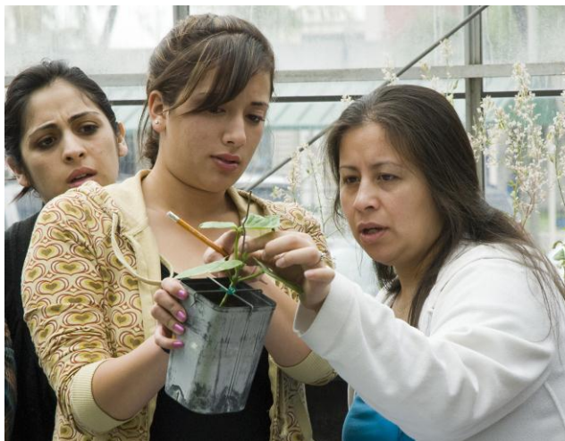
California State University, Los Angeles

46% of FY students at least occasionally spent time with faculty members on activities other than coursework.