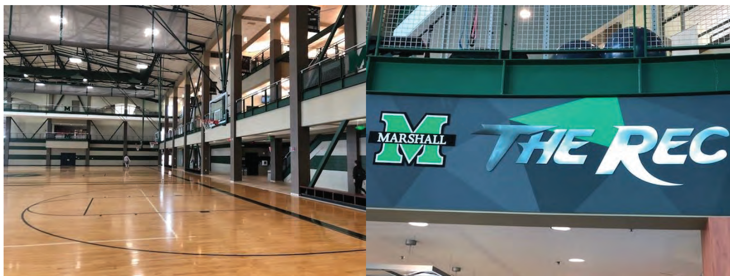
9 Gym court panels and 2 balconies