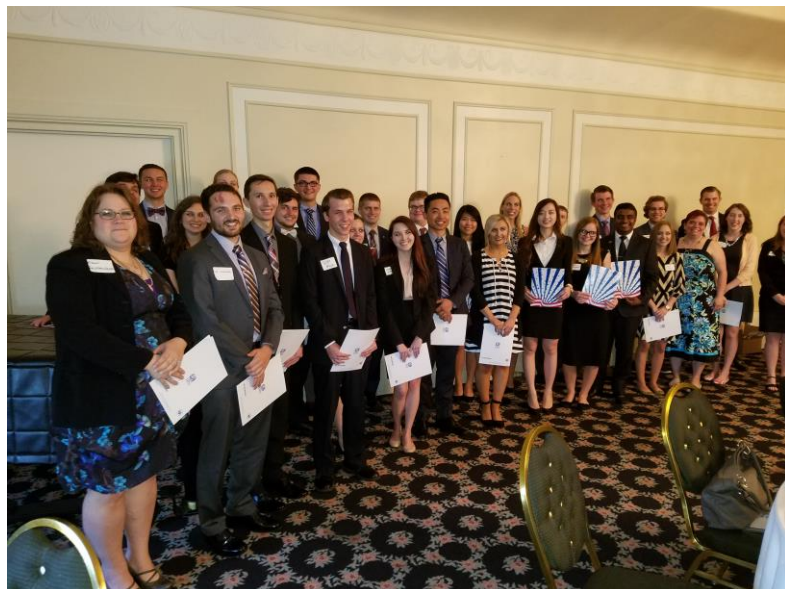
Vita Volunteers, April 2017