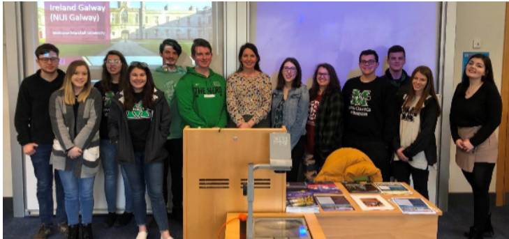
Marshall students at the National University of Ireland in Galway in March 2019.