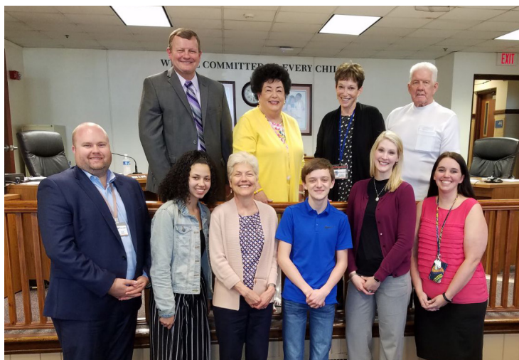
Cabell County Board of Directors Meeting.