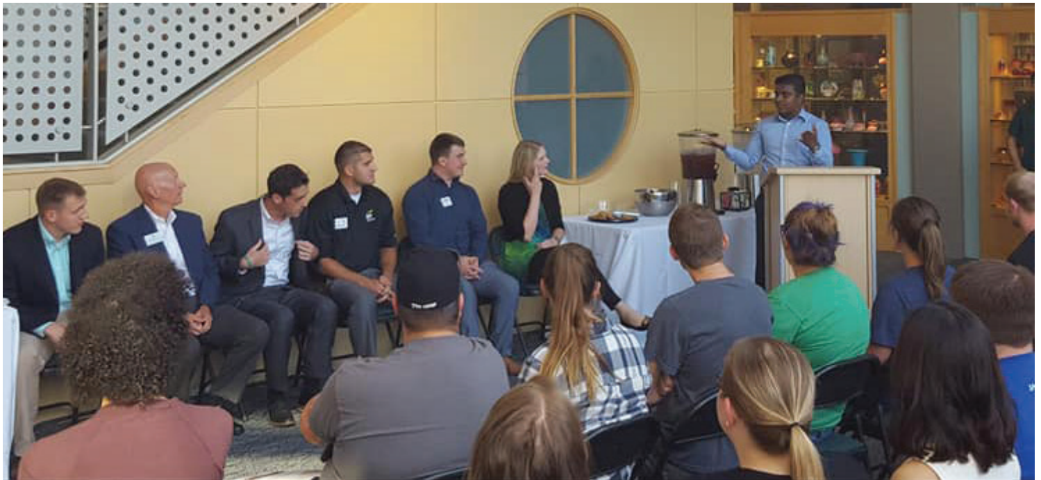
Student interest night