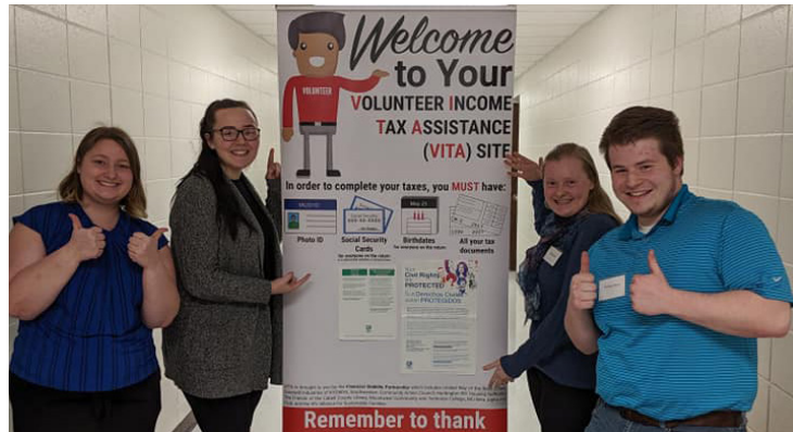
Beta Alpha Psi's Volunteer Income Tax Assistance First Day

Volunteer Income Tax Assistance (VITA) was held again this tax season through the partnership of Marshall University's Beta Alpha Psi and the United Way of River Cities. VITA is a program through the Internal Revenue Service that offers free tax assistance to students and low-income members within the community. The site assists with simple 1040s, basic 1040NRs, and Form 8843, having the capability to assist many international students with their tax needs. VITA allows students to help people within the community while also providing