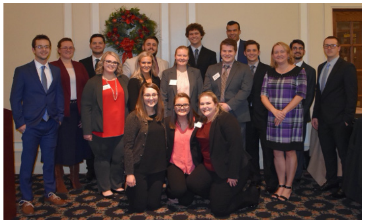
Beta Alpha Psi 2019-2020 Officers and Fall 2019 Inductees