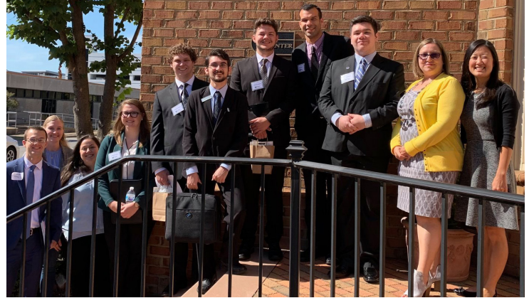
Beta Alpha Psi during the Fall 2019 Visit the Firms event in Charleston, WV.

Horse Rescue in Huntington, WV to hold a community service day at their farm. Our chapter was able to help prepare the barn for winter, fix fences, feed the horses, and assist the organization in various yard work. We also organized a cookout at the end of the day for all the volunteers. This was a very beneficial community service project for our chapter in several ways. Our members were able to work with a nonprofit to give back to the community in a fun and unique way. Additionally, this new project brought new participants and increased networking among our members. We were able to connect with the new participants and current chapter members, and work on our teambuilding skills to help the Heart of Phoenix. We hope to continue this project next year.