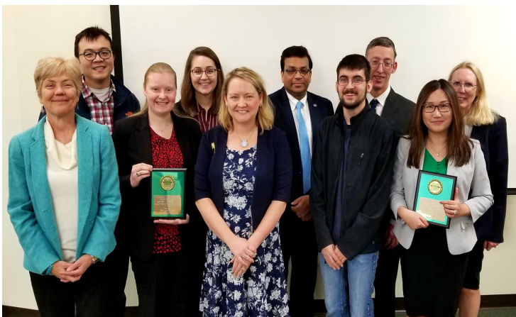
Marshall University announces Beta Alpha Psi as Student Organization of the Year