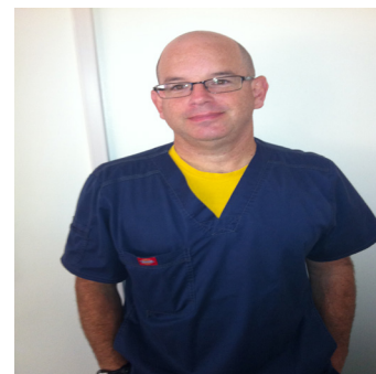
TED FOX SCHOOL OF NURSING