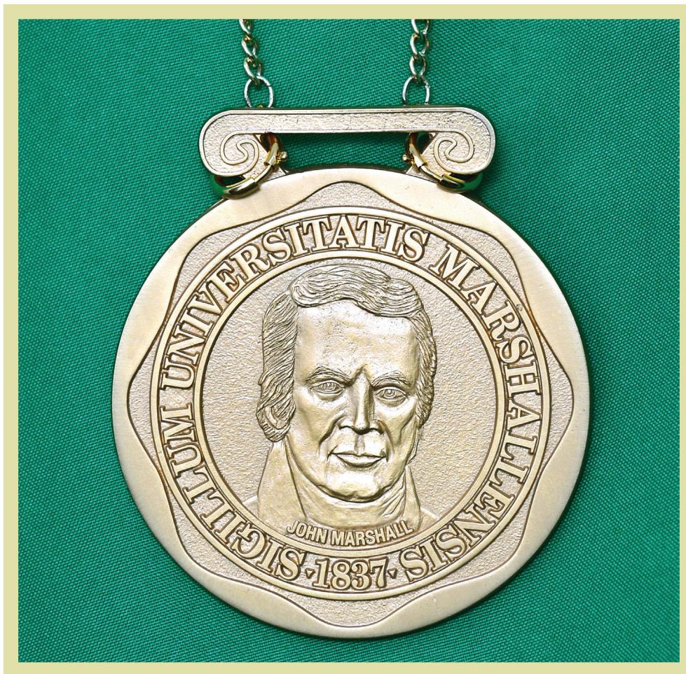
The President's Medallion and Grand Mace

Marshall University traces its origins to the founding of the Marshall Academy in 1837. The Academy was named in honor of John Marshall, the fourth Chief Justice of the United States Supreme Court, who died on July 6, 1835.