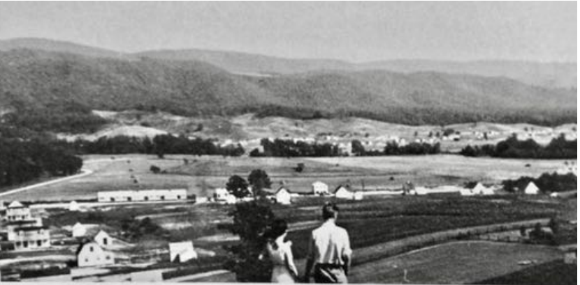
This view of the Dailey and East Dailey homestead houses was photographed in October, 1936, looking to the east toward Cheat Mountain. The site for the Trade Center Building is to the right of the couple. The caption for a similar picture which appeared in a Pittsburgh newspaper on October 25, 1936 stated that "for thousands of persons over the United States, life was really begun - in 1936. Their parents and their parents before them had been

PPH: Near Scotts Run, The Tygart Valley Homestead was developed by the Subsistence Homestead Division. Rural rehabilitation focused on helping individual families regain their ability to sustain themselves and to develop a group