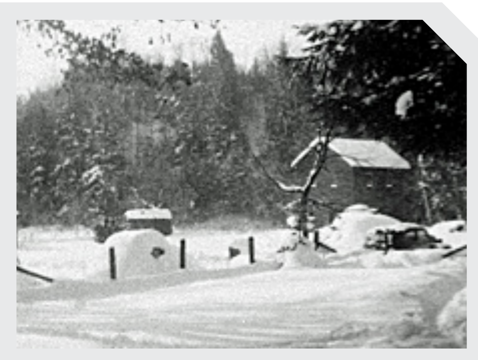
Snow drifts are hiding cars after the Thanksgiving Blizzard of 1950.

affecting them. In addition, by sharing my own climate story, I hope to exemplify how we can enact the tools of anthropology to advocate for our own people. We can only truly understand how our climate is