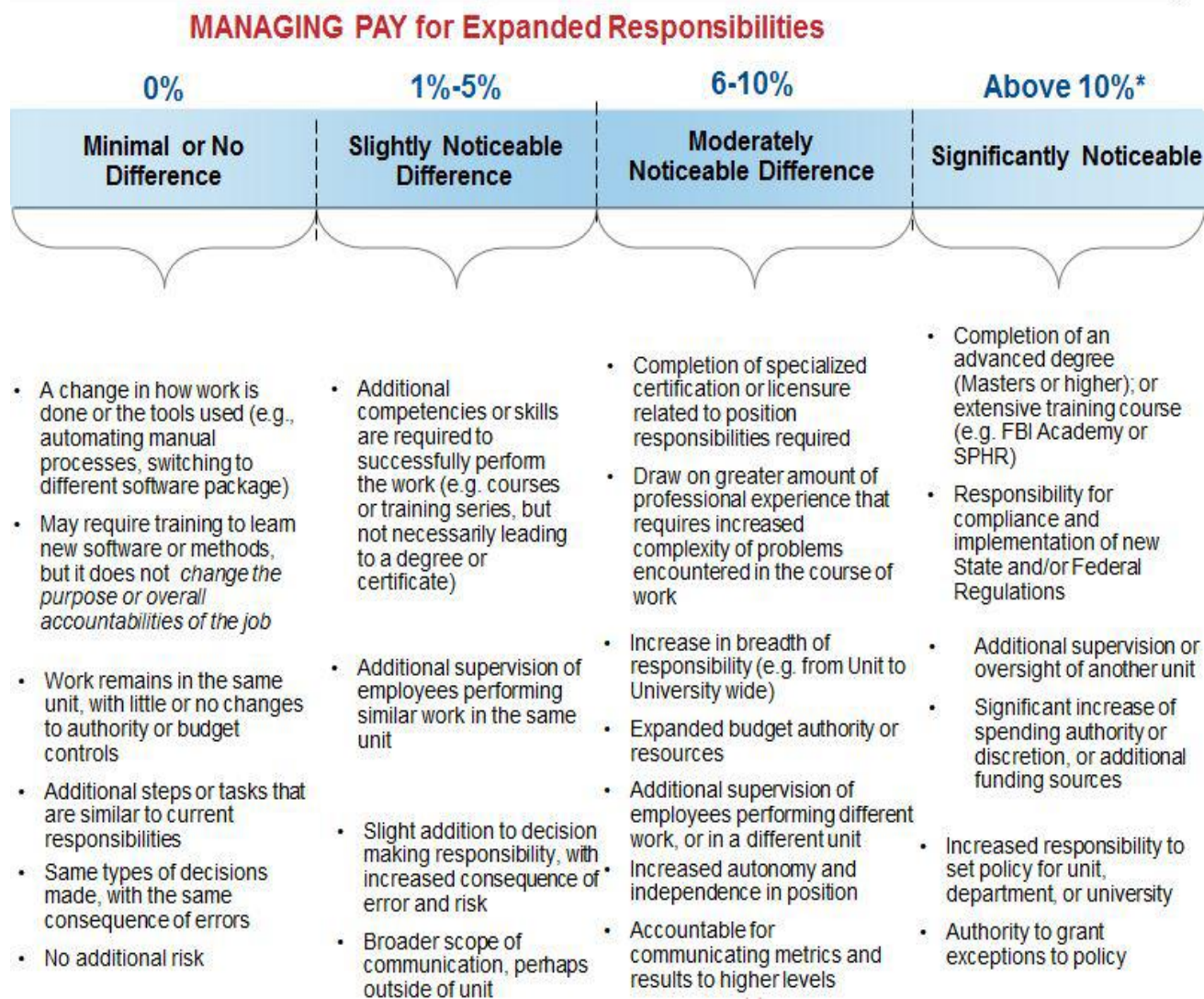
Graphic 2: Managing Pay for Expanded Responsibilities

*Salaries should not be increased outside of the range associated with the identified position classification