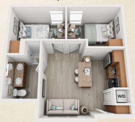
2 Bed Apartment, 1 Bath