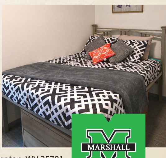
The Landing | 1130 14th St | Huntington, WV 25701