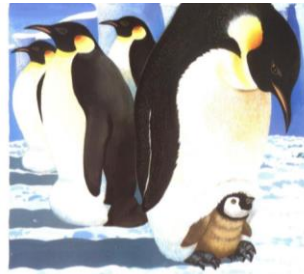
He keeps me safe and warm.