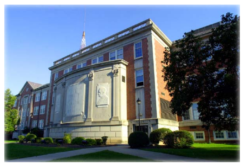
College of Science Building