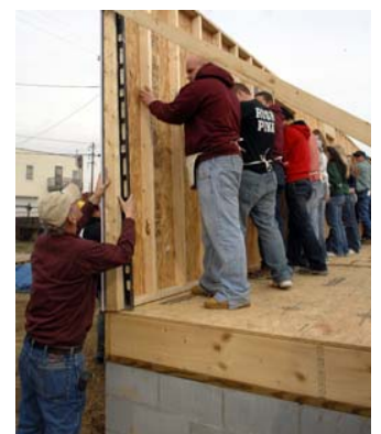
MU Students raise a wall on a Herd Habitat for Humanity house.

Concentrating on academics to achieve the best grades possible is extremely important. However, outside activities can play a crucial role in admission to professional school. Activities that might be helpful would include some volunteer work (e.g. the Red Cross, Habitat for Humanity, hospitals, etc.).