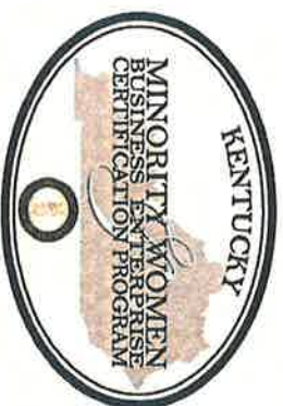
MATTHEW G. BEVIN GOVERNOR

A blue ink signature of Matthew G. Bevin, written over a horizontal line.