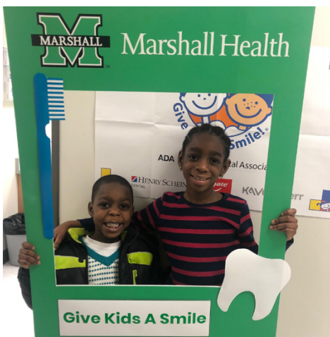
Marshall Health cares for communities in need through outreach programs like this free teeth cleaning event.

86% OF MARSHALL MEDICAL STUDENTS ARE FROM WEST VIRGINIA