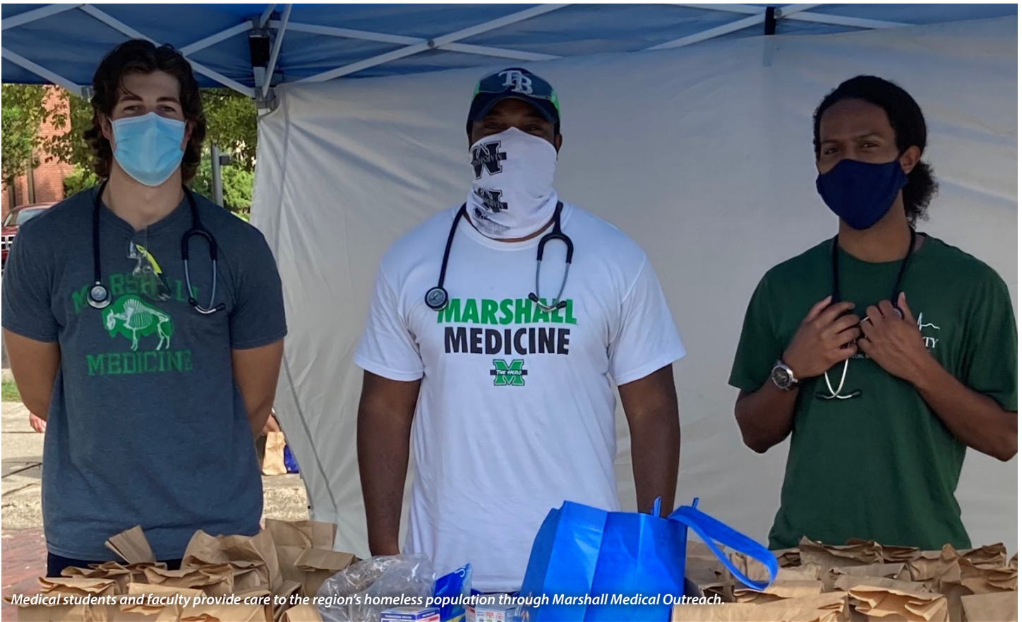
Medical students and faculty provide care to the region's homeless population through Marshall Medical Outreach