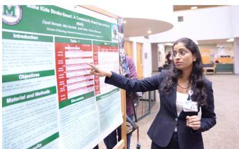
A neurology resident presents her findings during the medical school's annual Health Sciences Research Day.