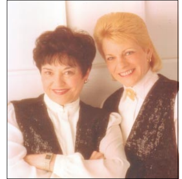
The Two of Hearts will appear April 29 to benefit the Autism Training Center.

For those who cannot attend the concert, organizers say contributions are welcome.